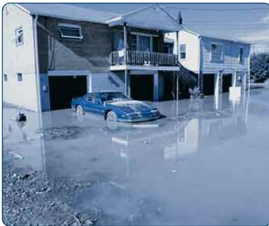
Flooding. Canton, NC, September 18, 2004

If your household uses a typical septic system, heavy rains and floods can halt its ability to treat wastewater from your home. When rainwater or flood waters pond over the drainfield, there is no place for wastewater from the household plumbing to drain because the drainfield and soil beneath are saturated, and your entire system can fail.