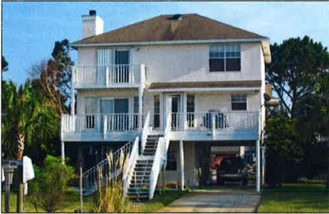
Elevated home on pile foundation