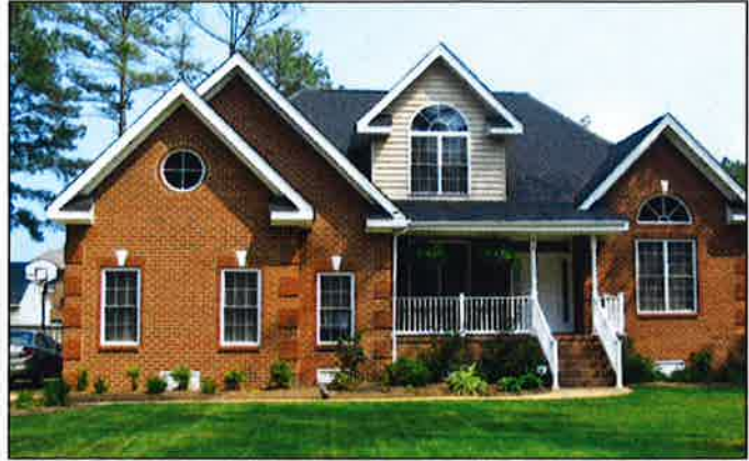
Elevated home on crawl space foundation

make conventional loans for insurable buildings in flood hazard areas of non-participating communities. However, the lender must notify applicants that the property is in a flood hazard area and that the property is not eligible for Federal disaster assistance. Some lenders may voluntarily choose not to make these loans.