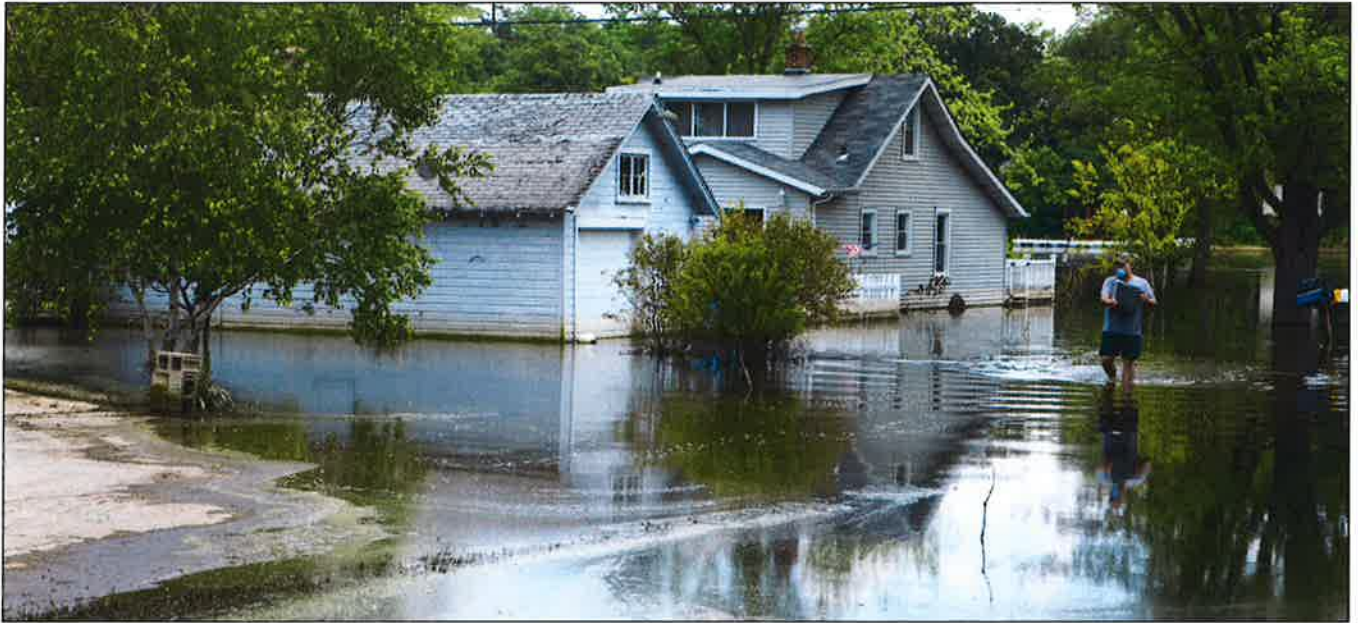
Janesville, Wisconsin, 2008