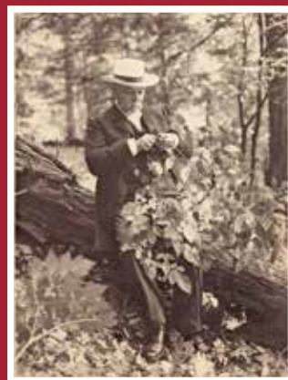
PA Gov. Samuel W. Pennypacker

https://www.instagram.com/pennypackermills/