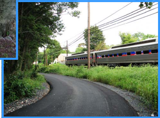
Top - New trail through mature woodlands