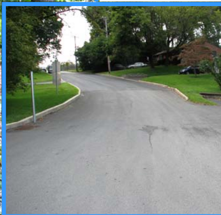
Above - Link between public works yard and high school