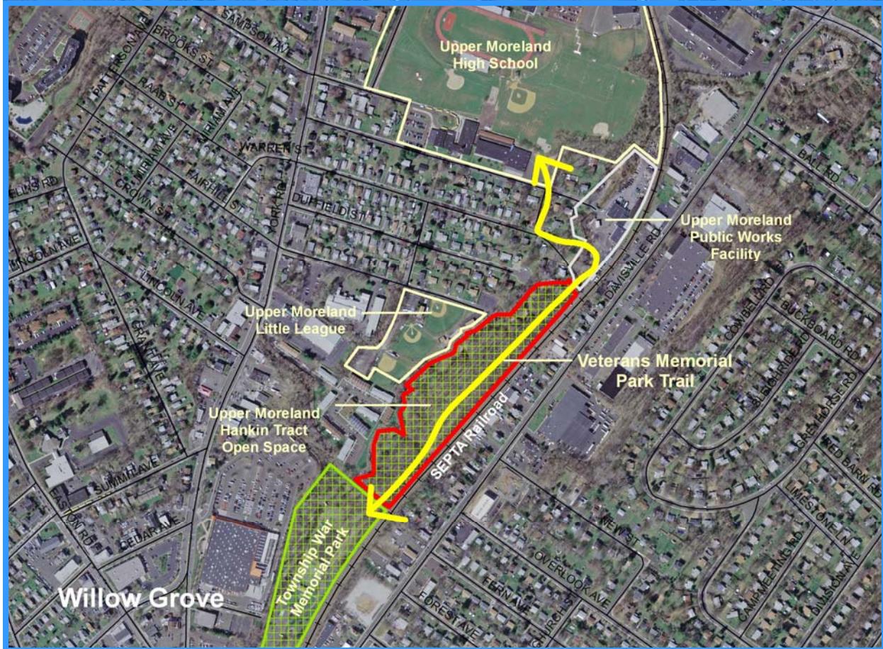
Project Location: At upper end of War Memorial Park in Willow Grove area Public access and parking at War Memorial Park

Upper Moreland Township Veterans Memorial Park Trail Green Infrastructure Grant Approved 2008 • Project Completed 2009 Parkland Previously Deed-Restricted