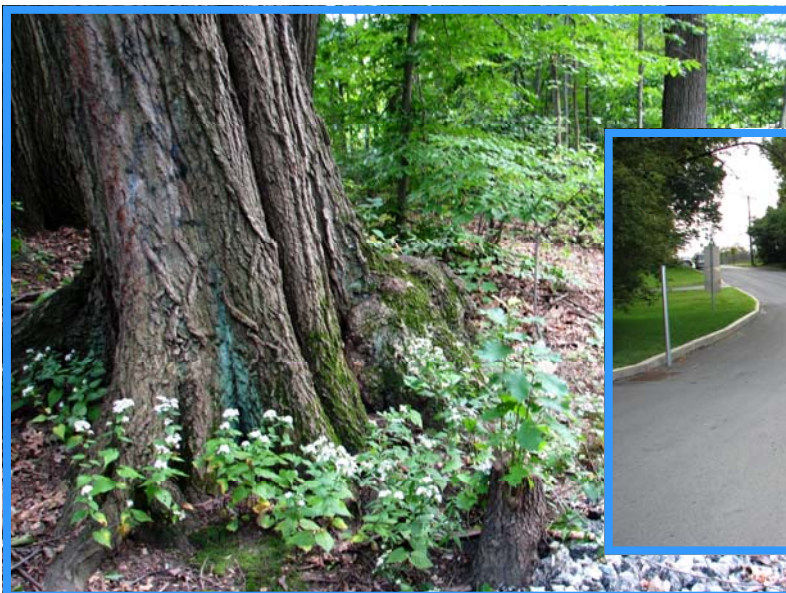
Above - Large trees along edge of trail