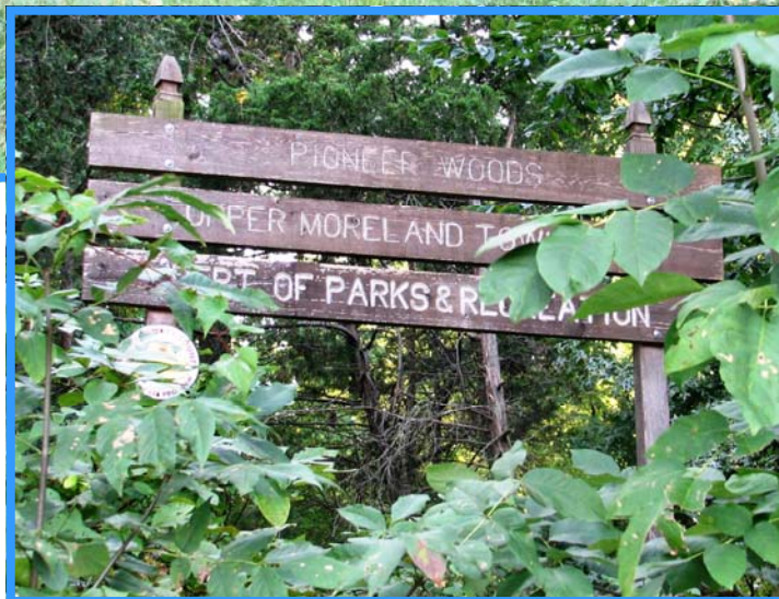
Left - View into property from Pioneer Road