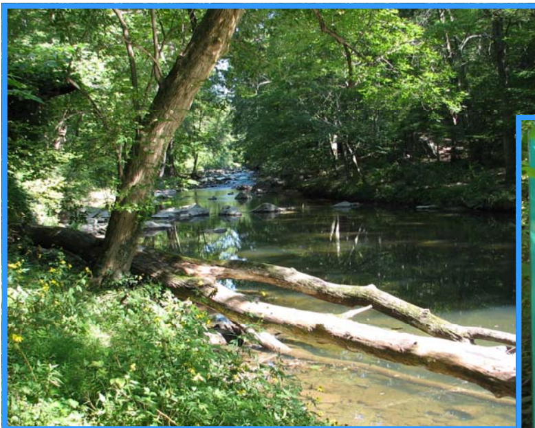
Above - Pennypack Creek at foot of Cardone property

Public access via Mitchell Trail from Creek Road or Huntingdon Road; parking at Pennypack Trust Edge Hill Road lot