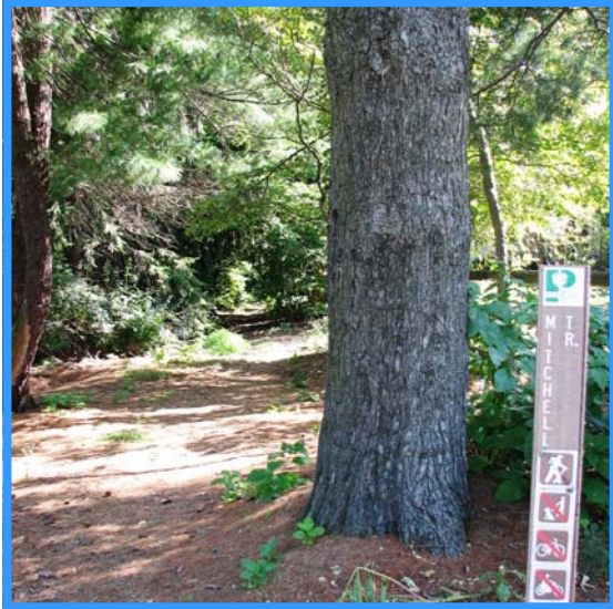
Bottom and Top Left - Scenic Mitchell Trail landscape