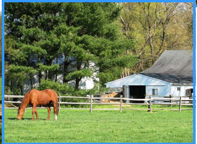
Above and left - horse pastures surrounding farmstead area