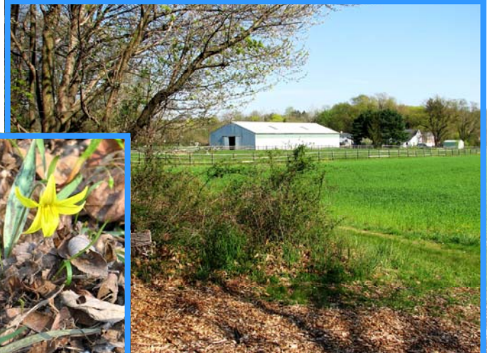
Early spring view across farm fields