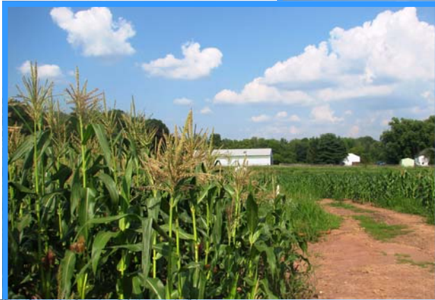
Below and right - views toward new open space from existing township park