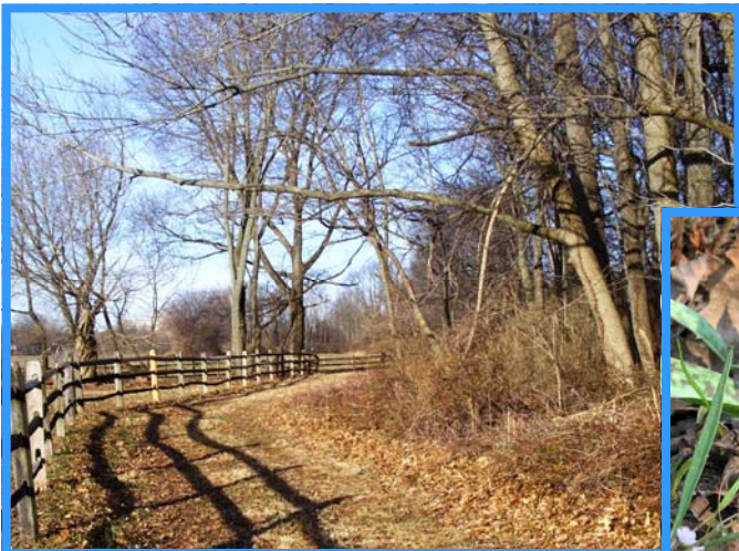
Farm lane at back edge of new open space

Project Location: 2642 Butler Pike, Plymouth Meeting; public access to adjoining park from Narcissa Road parking area