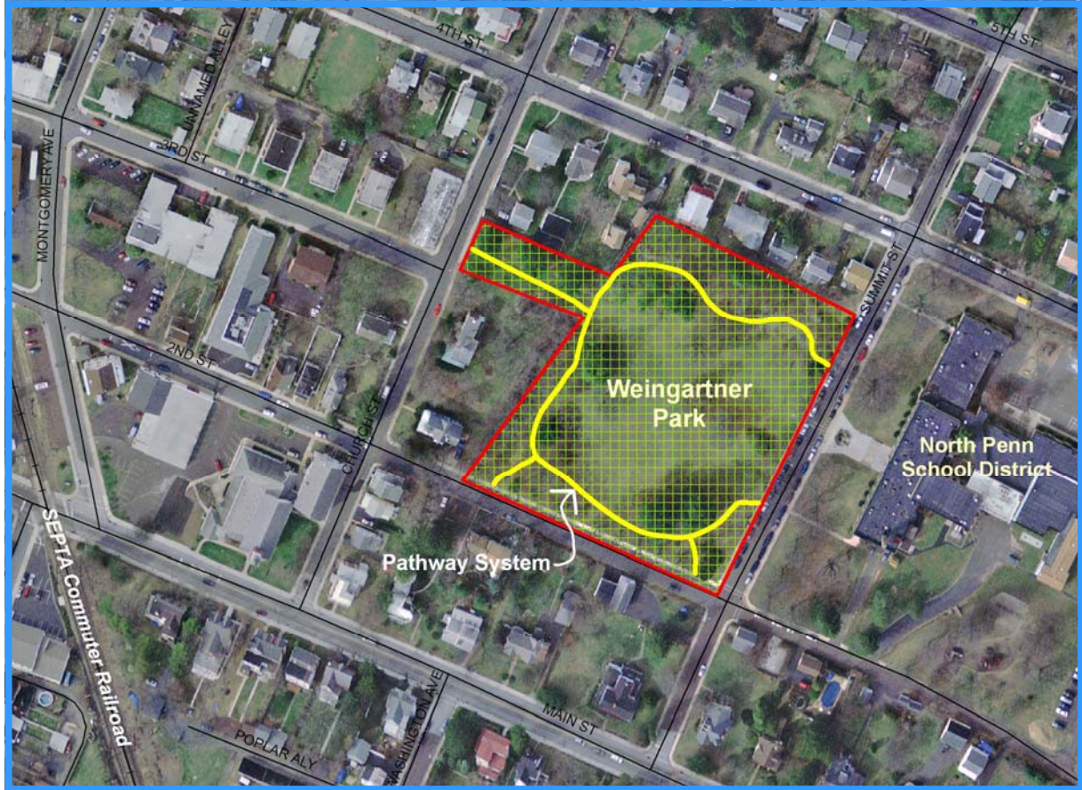
Project Location: Corner of 2nd and Summit Streets one block from Main Street Public access from sidewalks via trail spurs on Church, 2nd, and Summit Street; parking on street

North Wales Borough Weingartner Memorial Park Improvement Project Green Infrastructure Grant Approved 2007 • Project Complete 2008 Deed Restriction Required on 3.7-acre Park