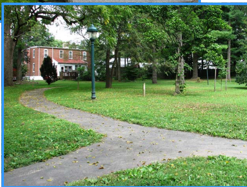
Above and Right - Completed paths create park loop and connections to abutting streets