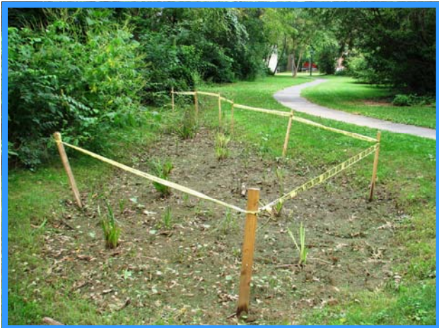
Above - Rain garden under construction