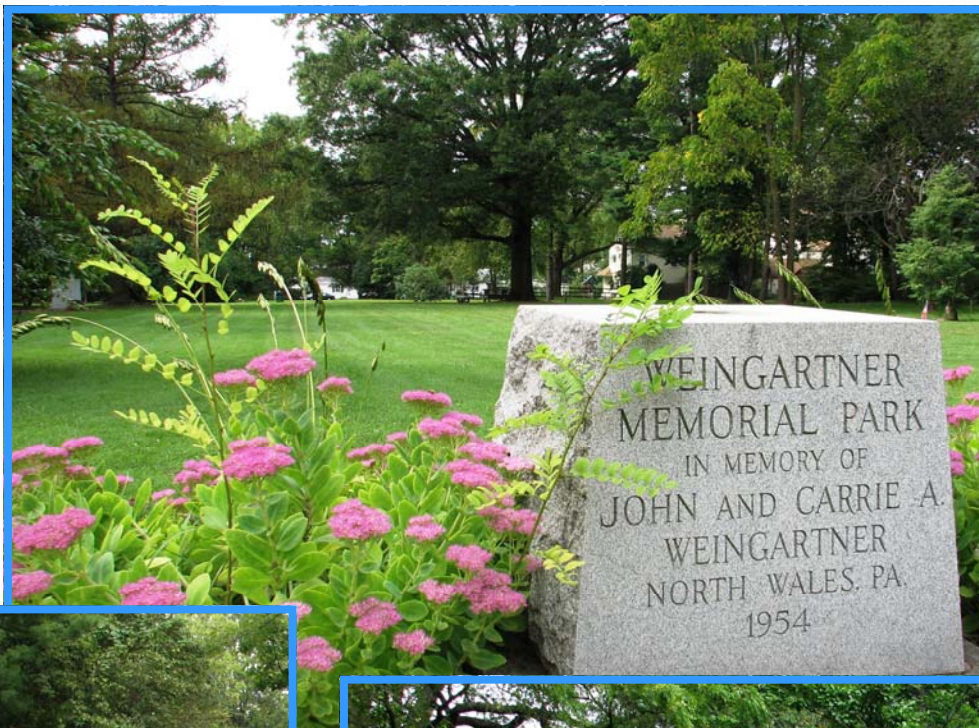
Left - Park is dedicated to the Weingartner Family