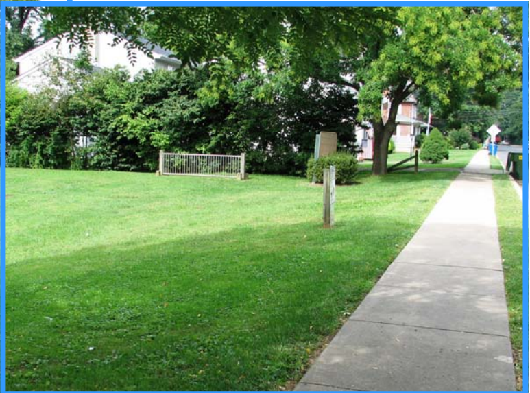
Left and Right - Areas of future improvement phases