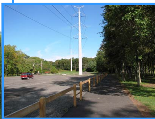
Left - Existing Power Line Trail