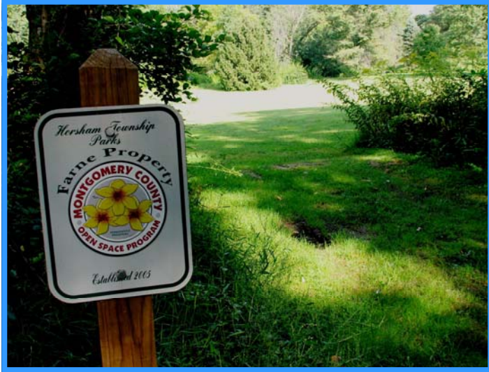
Above Left - Entrance to Farne open space from Deep Meadow Park