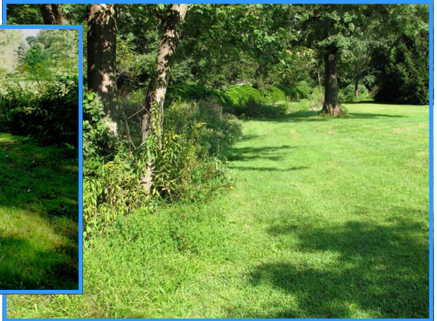
Above Right and Below - Open lawn of Farne Property Is edged by intermittent tributary stream