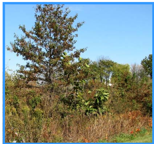
Above Right - Existing Borough natural area