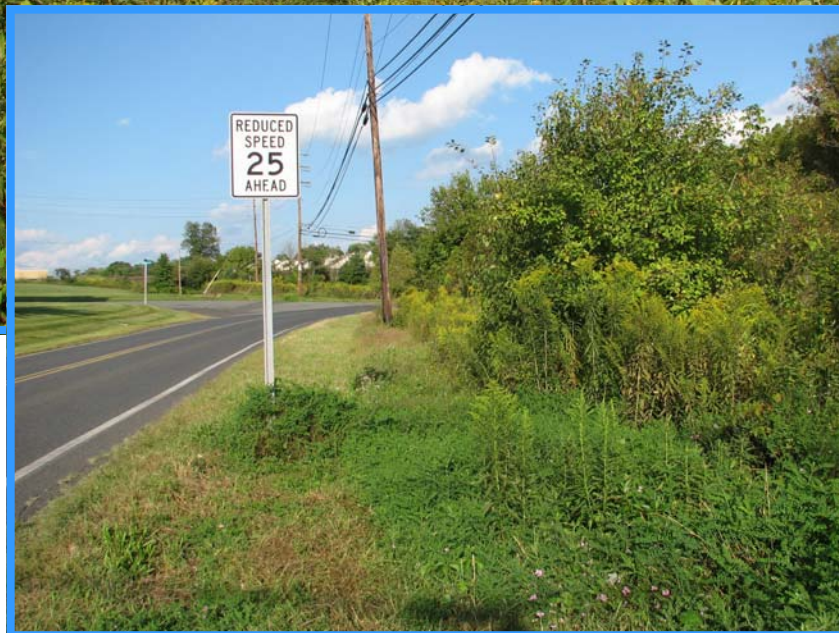
Left - Stream corridor, on right side of road, is heavily buffered from traffic approaching intersection of State Street with Sixth