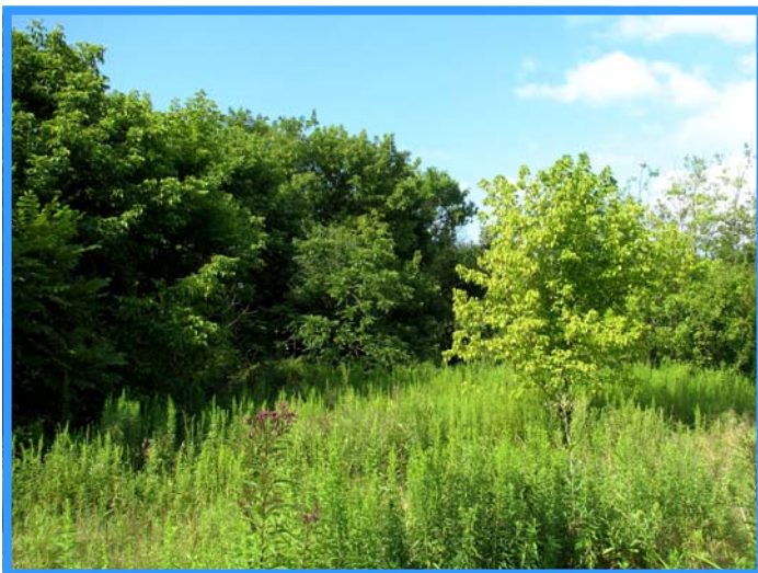
Above Left - New open space in midsummer