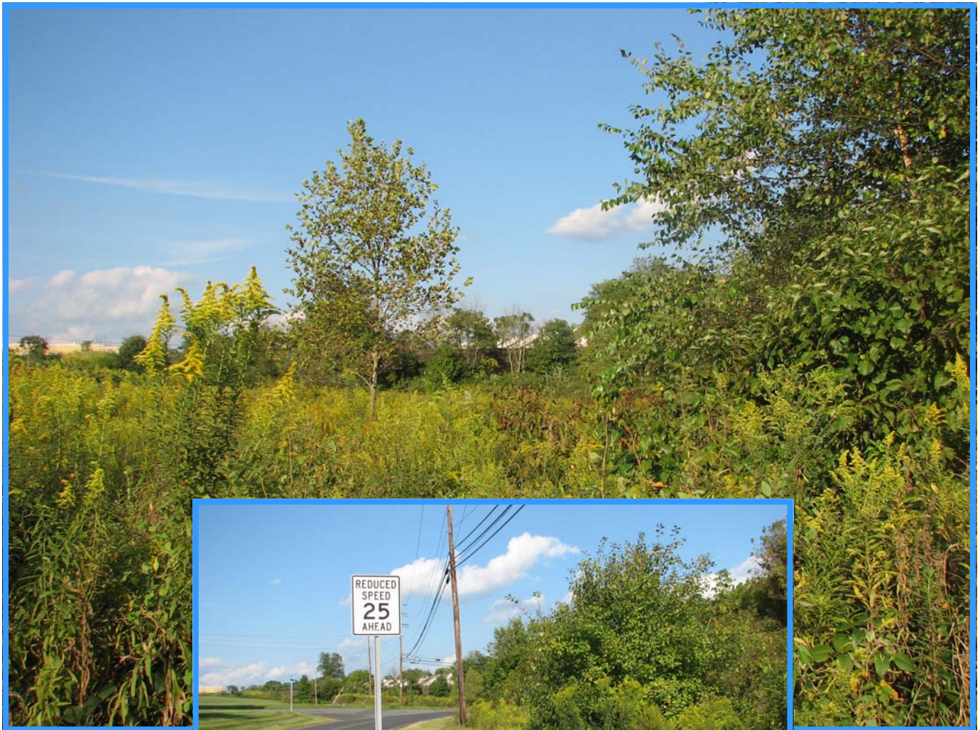
Above - New open space is thickly covered with trees, shrubs, and meadow species