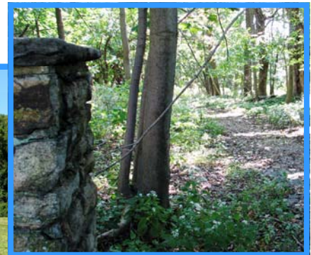
Above Right - Old stone gate at Sherwood Road