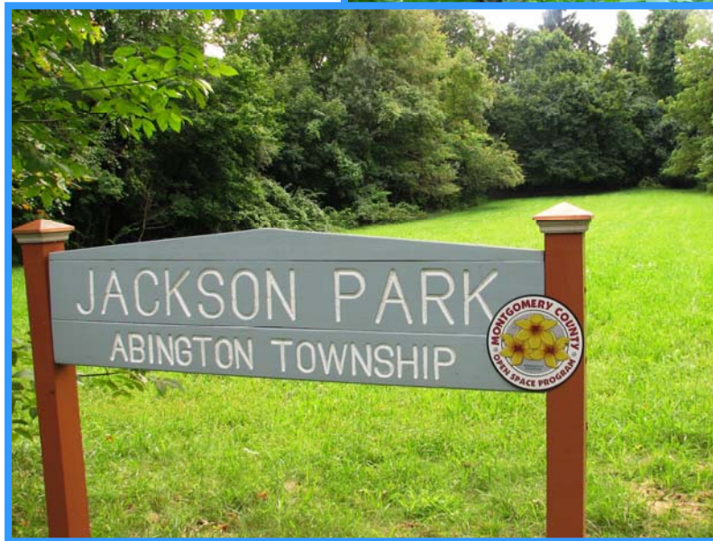
Above and Right - Meadow and woodland areas of Jackson Park