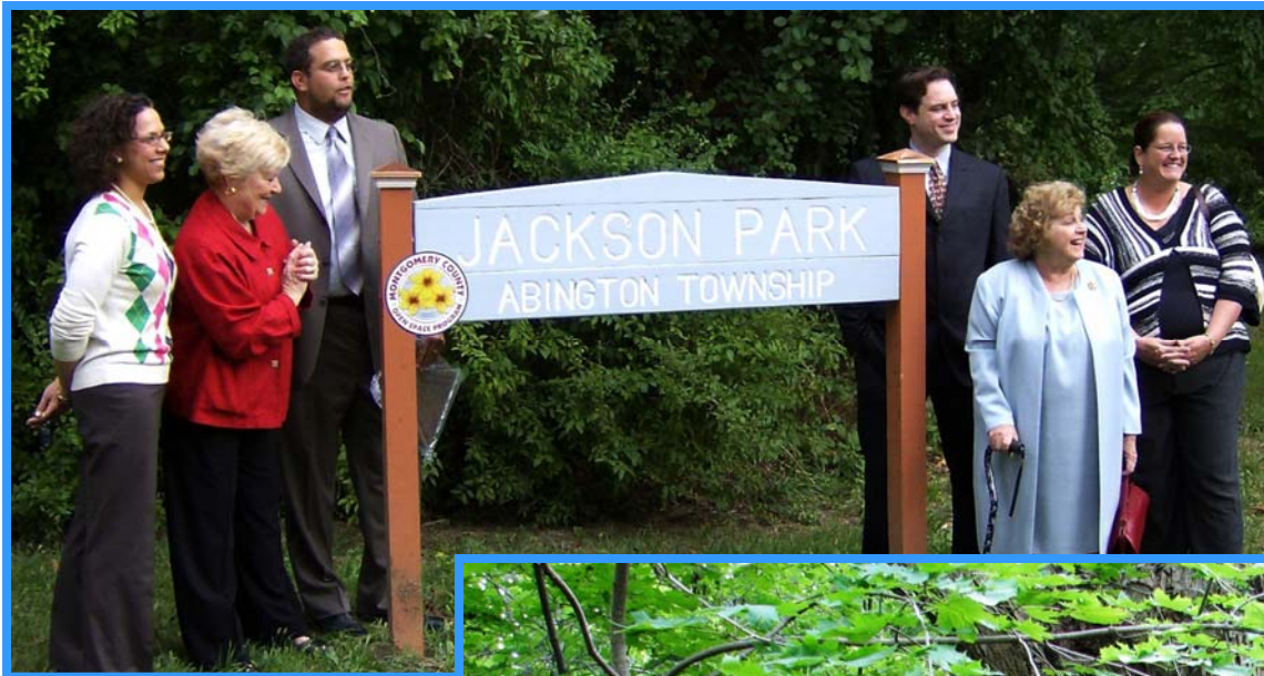
Left - Dedication of Jackson Park