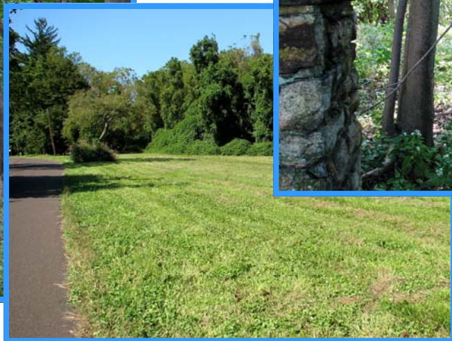
Above Middle - Amity Road frontage