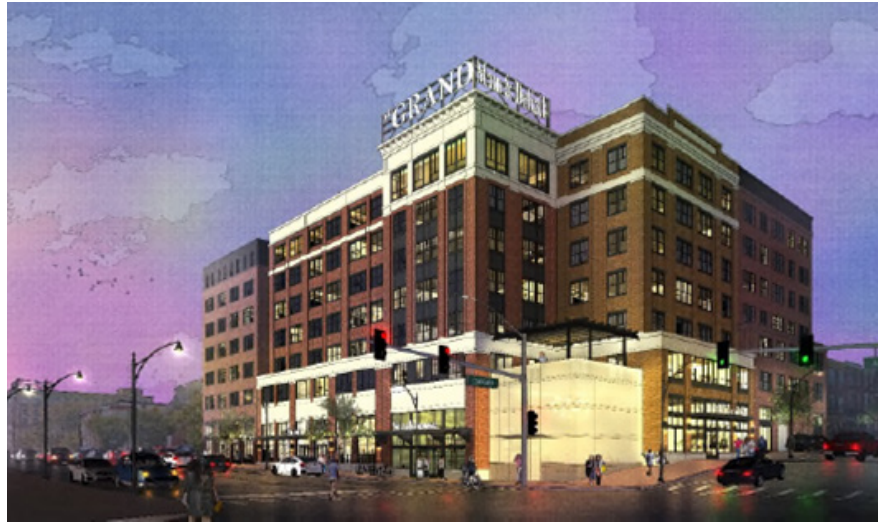
"The Grand" rendering – Norristown

The redevelopment of Main Street in Norristown will take a big leap with the recent approval of an exciting mixed-use ground-up construction project at the corner of Main & DeKalb Streets. In September, Norristown Municipal Council unanimously approved the sale of the site from the Redevelopment Authority to MM Partners. MMPartners will develop a seven-story building housing 111 apartments and two retail storefronts.